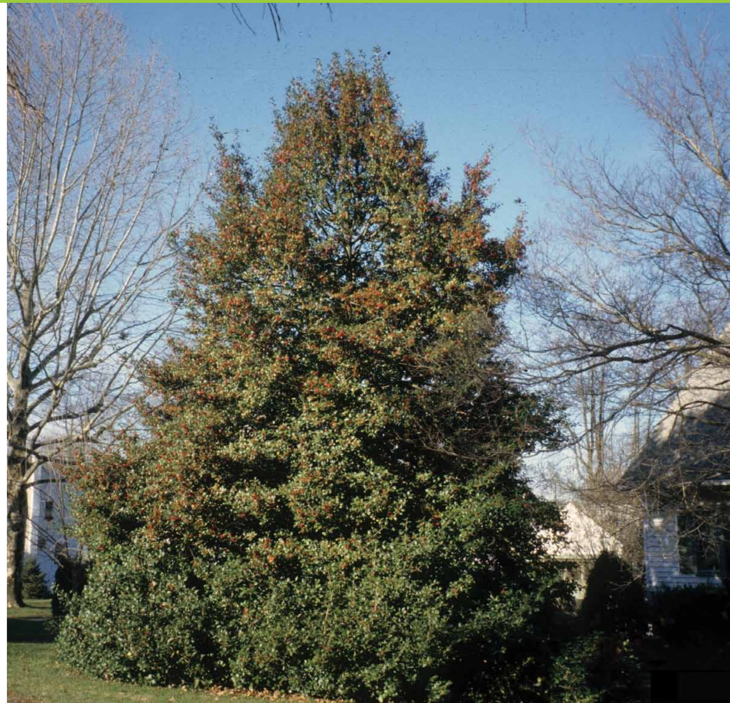
Richard Webb, Self-employed horticulturist, Bugwood.org

Flowers: Small white flowers in late spring followed by red or yellow berries in fall that persist throughout winter months